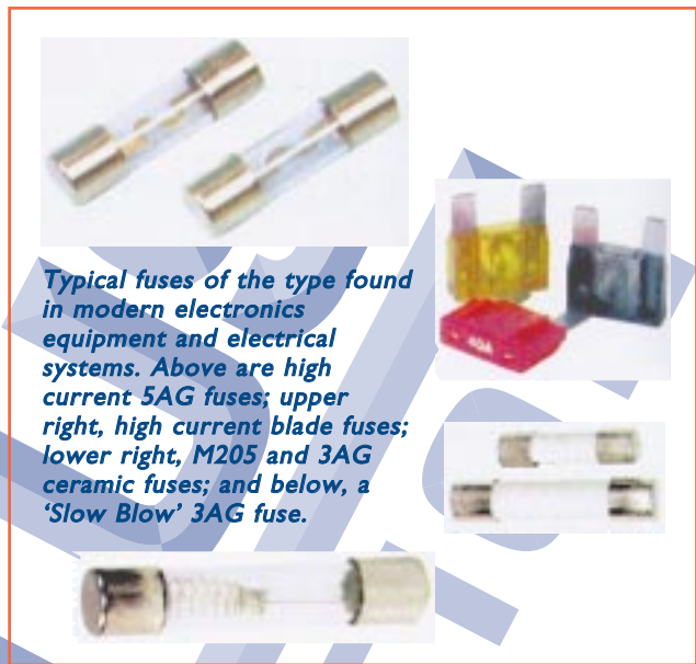
Typical fuses of the type found in modern electronics equipment and electrical systems. Above are high current 5AG fuses; upper right, high current blade fuses; lower right, M205 and 3AG ceramic fuses; and below, a 'Slow Blow' 3AG fuse.

Needless to say fuses take a finite time to 'blow', and this fusing time tends to vary inversely with the overload current level. So an overload causing say five times the usual current